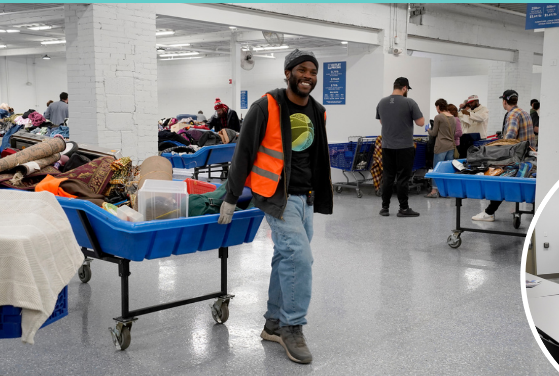
(Left) The Cleveland Outlet officially opened November 3, 2023. (Below) The Opportunity Center is housed in the same building as the outlet. (Center) The Cleveland Outlet features a mural by Cleveland artist Chad Fedorovich of Cleveland Mural Co.