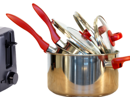
POTS & PANS