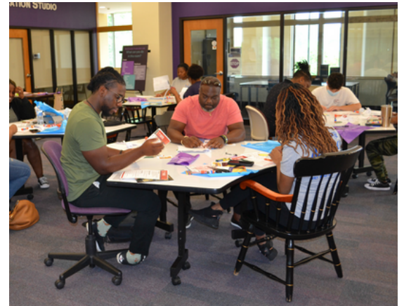
Project Blueprint is a new Goodwill mission program focused on improving diversity in volunteer leadership positions.

Each of these mission programs meets a need in the communities that we serve and will be supported by the stores that we operate. You will read in this edition of the Doing Good newsletter how we have relocated our Eastlake store to a new, larger site in Willowick. You will learn about our new Mobile Donation Center program. And, you will even get a chance to check out our Halloween Lookbook. All of these retail efforts drive support to these mission efforts which ultimately change lives for good .